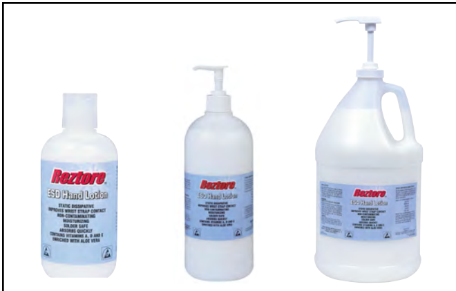
Figure 1. Reztore™ ESD Hand Lotion.