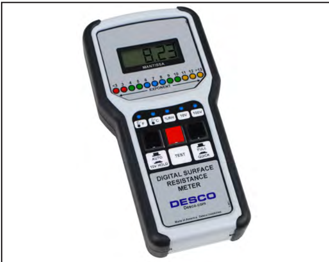
Figure 3. Desco 19788 Digital Surface Resistance Meter