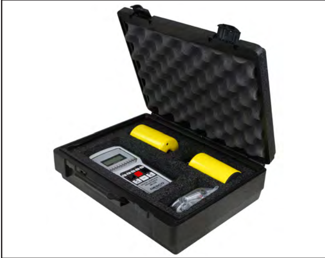
Figure 2. Desco 19787 Digital Surface Resistance Meter Kit