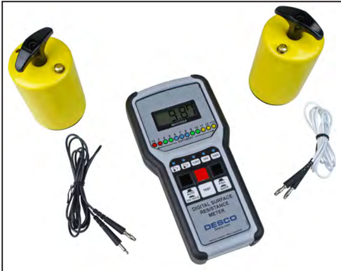
Figure 1. Desco Digital Surface Resistance Meter Kit