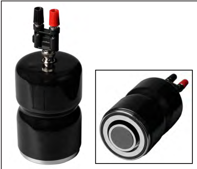
Figure 7. Desco 50005 Concentric Ring Probe

The Desco 50005 Concentric Ring Probe is an instrument to be used in conjunction with a resistance meter, such as the Desco 19787 Digital Surface Resistance Meter, to measure surface resistance per ANSI/ESD STM11.11 the test method listed in Packaging standard ANSI/ESD S541 for surface resistance of planar materials.